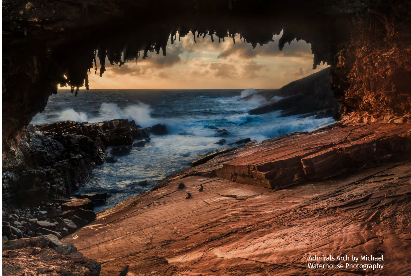
Admirals Arch