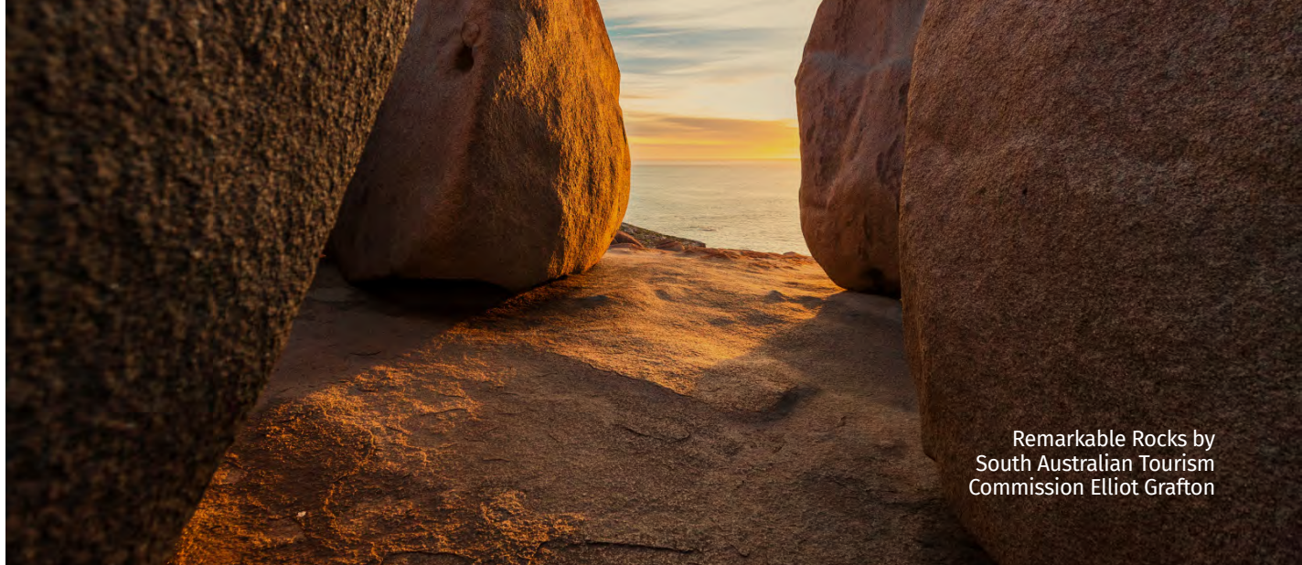
Remarkable Rocks by South Australian Tourism Commission Elliot Grafton

What do we carry? All you need to carry is a daypack, containing a drink bottle, lunch, rain jacket and a camera. The guides carry the rest!