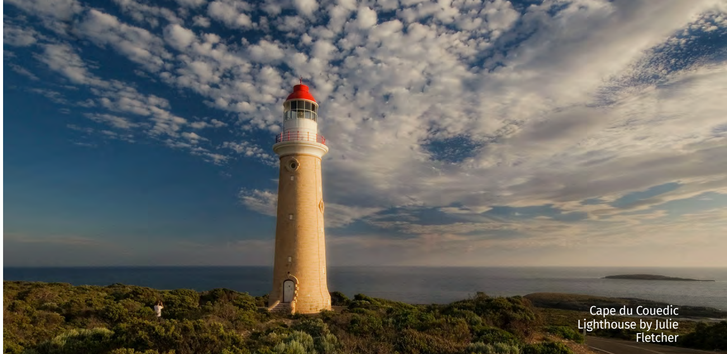
Cape du Couedic Lighthouse by Julie Fletcher