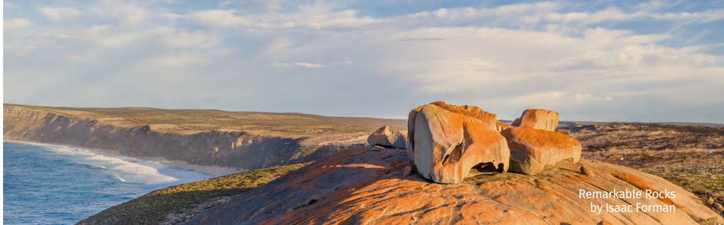
Remarkable Rocks by Isaac Forman