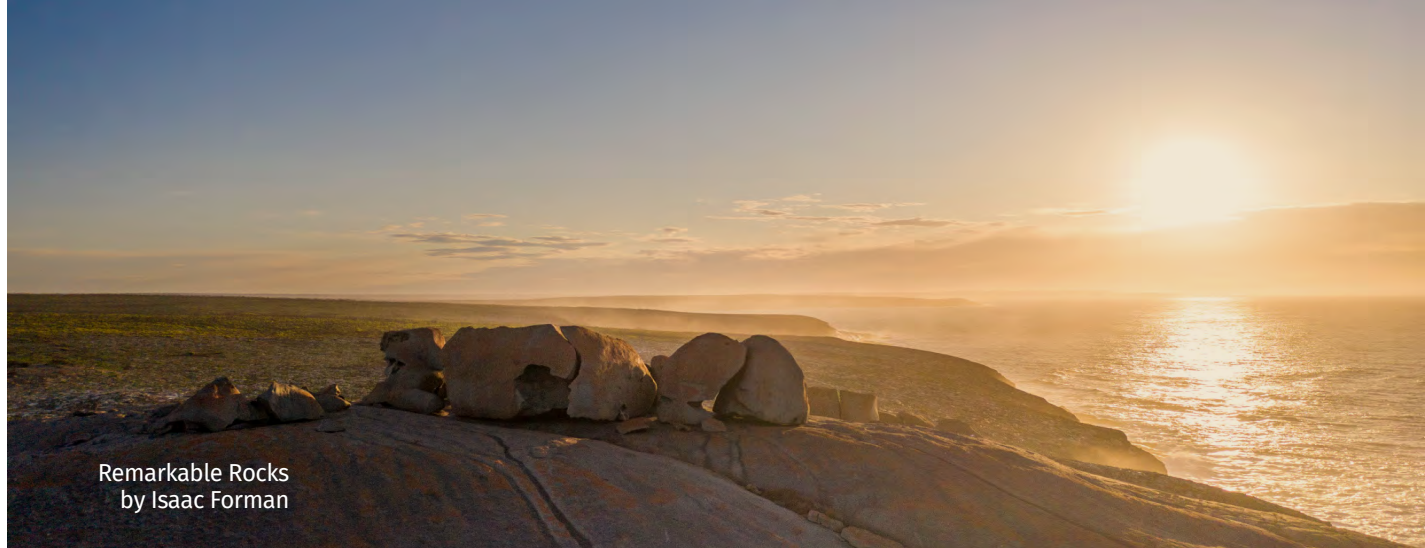
Remarkable Rocks by Isaac Forman