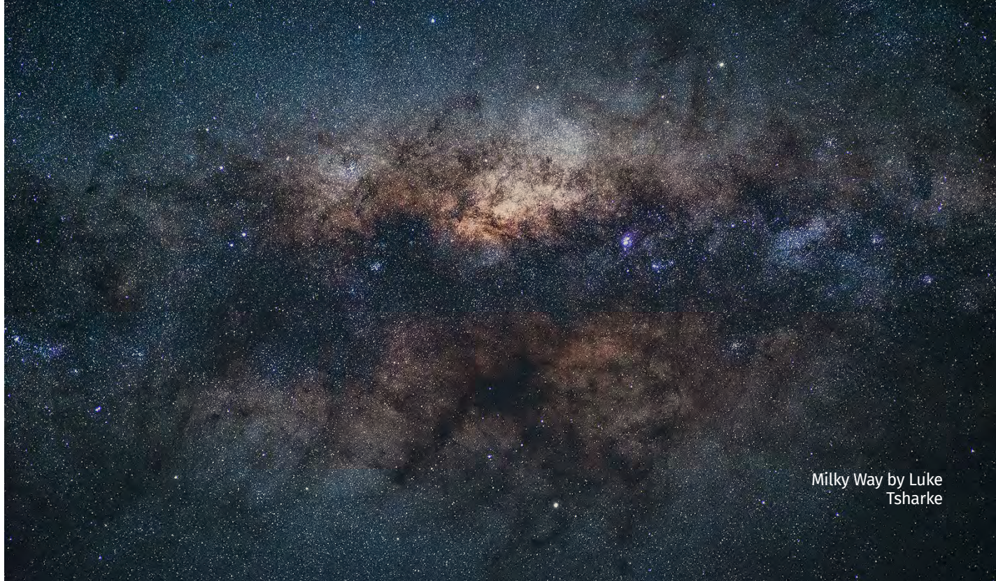
Milky Way by Luke Tsharke